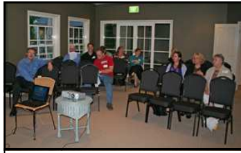
Some of the AGM crowd.

The night of Tuesday 16th of November was our Annual General Meeting for 2010.